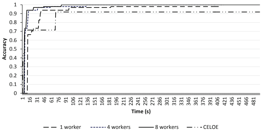
Fig. 3. Learning using the UCA1 dataset

Figure 3 shows details for the UCA1 dataset. In this case, CELOE cannot compute a very accurate result before it times out, whereas ParCEL succeeds. Adding more threads can again speed up the computation significantly.